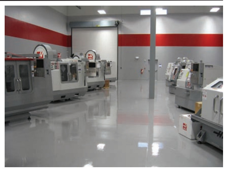
Stonhard installed a seamless, epoxy floor system in the Haas CNC shop. This extremely durable floor is also chemical, abrasion and slip resistant.

industry. In fact, there are Stonhard floors throughout the tool manufacturing facilities in Haas' California plant. Haas CNC Racing eagerly partnered with Stonhard for the floors in this large project.